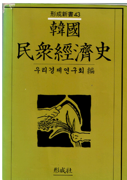
1987 edition cover

official endorsement of Stalin, but this did not stop those advocating the "two roads" theory (feudalism in Europe and an Asiatic mode of production in the non-European world) from continuing the debate well into the 1930s. 15