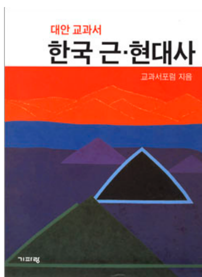
New Right textbook